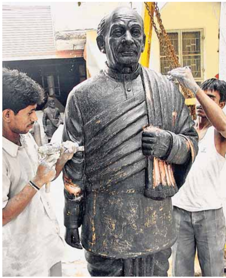
■ Sculptors give finishing touches to a life-size bronze statue of Sardar Vallabhbhai Patel at Vastrapur. The 350-kg statue will be installed in Bapunagar locality of the city.